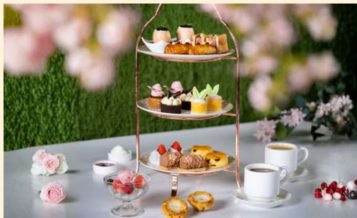
Photo is for dinner buffet and for reference only 圖片為自助晚餐及只供參考